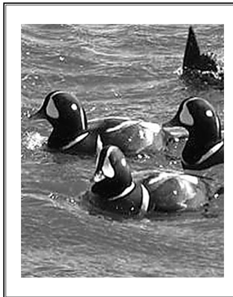
The November field trip to Barnegat Light never fails to deliver great looks at Harlequin Ducks.